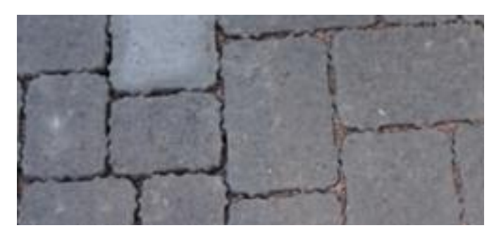
The joints on the right are full, where as the joints on the left require topping up with new joint aggregate.

It is therefore important not to allow any activities or storage of materials that may lead to clogging the joints. Examples would include mixing concrete or mortars, storing sand, soil, landscaping materials or garden mulch on the driveway.